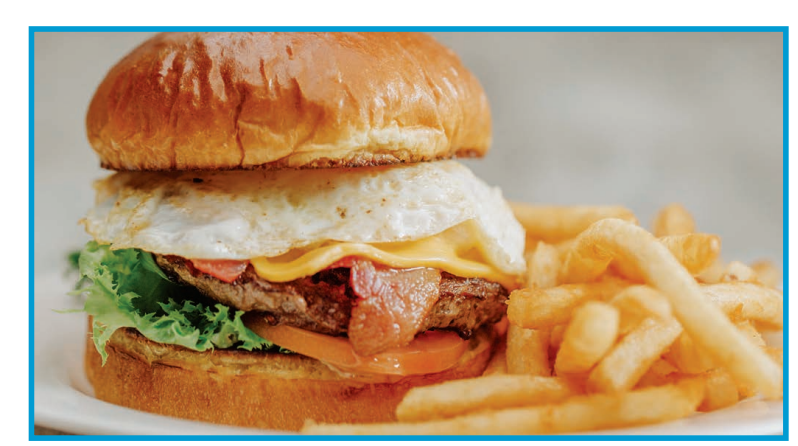
= Shoe Favorite

Two 1/3 pound all beef burger patties, American cheese, the Shoe's special sauce, and sweet heat pickles 12.49